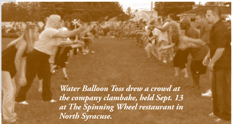
Water Balloon Toss drew a crowd at the company clambake, held Sept. 13 at The Spinning Wheel restaurant in North Syracuse.